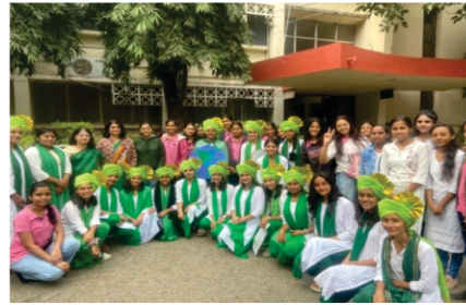
Skit for Green Earth-Clean earth