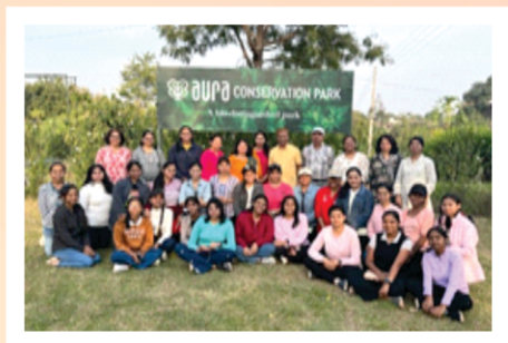
Excursion tour at AURA Conversion Park