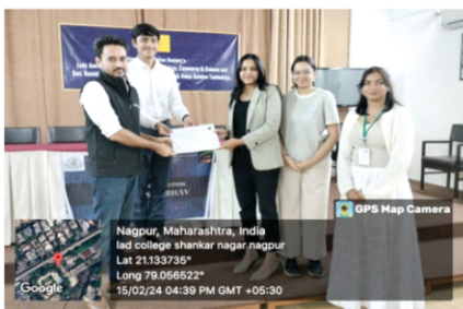
Suncap team-Shark tak Mission Smbhav 'AURA'