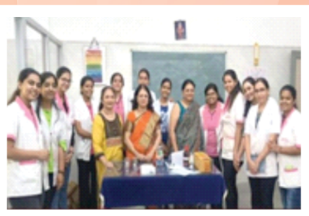
The perfume workshop