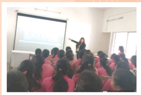
Seminar on You-niverse holistic healing,