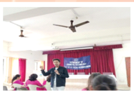
Workshop on Entrepreneurship Development