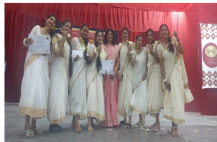
1st prize in Dance Competition 'AURA'