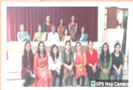
Teacher' Day Celebration