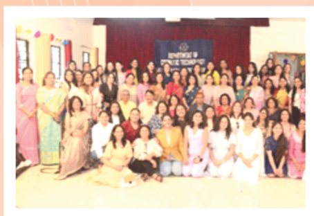
Alumnae Meet, 2023 "Coalescence"