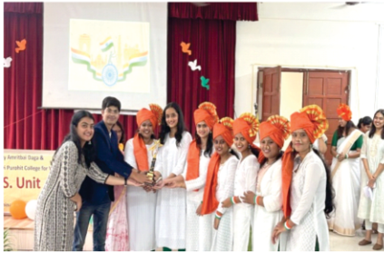
1st Winner of Patriotic Group