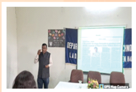
Seminar on Introduction of Intellectual Property