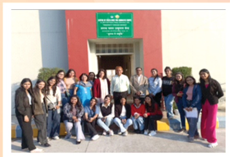
Visit to Centre for Aromatic Plants, Dehradun