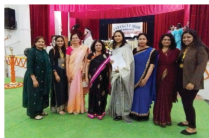
Toppers at University level