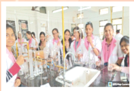
Students Working in The Laboratories