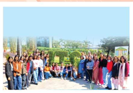
Industrial Visit to ITC Haridwar (U.P.)