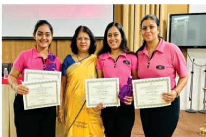
Pat on the back