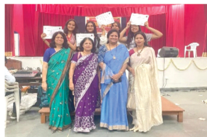
1st Winner of Singing Competition 'AURA'